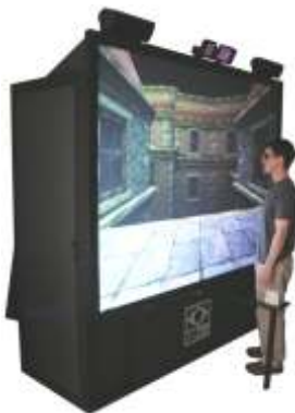
VisBox-P1 Compact and Portable

Resolution: 1920x1080 Brightness: 500 lumens per projector Screen: 72"x40.5" visible Size in use: 77"w x 77"h x 42"d Size folded: 77"w x 77"h x 34"d Mobility: casters. Rolls through doors.