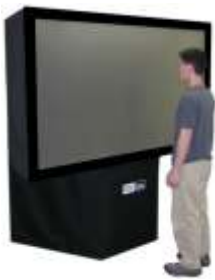
VisBox-HD Stereo HD monitor

Resolution: 1920x1080 Brightness: 500 lumens per projector Screen: 72"x40.5" visible Size in use: 77"w x 77"h x 42"d Size folded: 77"w x 77"h x 34"d Mobility: casters. Rolls through doors.