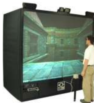
VisBox-X1 Standard Configuration

Resolution: XGA (1024x768) Brightness: 2100 lumens per projector Screen: 80"x60" visible Size in use: 84"w x 88"h x 55"d Size folded: 84"w x 80"h x 33"d Mobility: casters. Folds to 33"x80" profile to roll through doors.