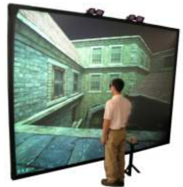
VisBox-X2 Large Screen VR

Resolution: XGA or SXGA+ Brightness: up to 5100 lumens per projector Screen: 92"x69" visible Size: 96"w x 89"h x 60"d Mobility: casters for movement within room